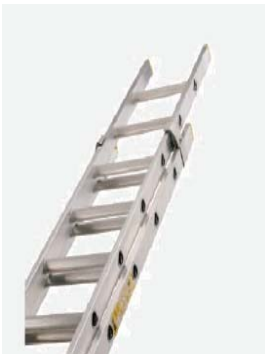
The use of metal ladders is prohibited when working with electrical equipment