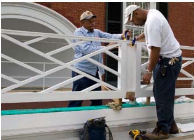
Perspective Second Quarter 2008

If you have any questions about this communication or the restructuring proposals, please visit the restructuring website at www.hrs.virginia.edu/restructuring or send inquiries to HRrestructuring@virginia.edu .