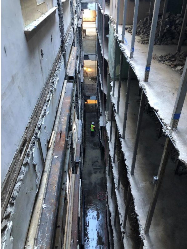
Creating a separation between building that stays and building to be torn down