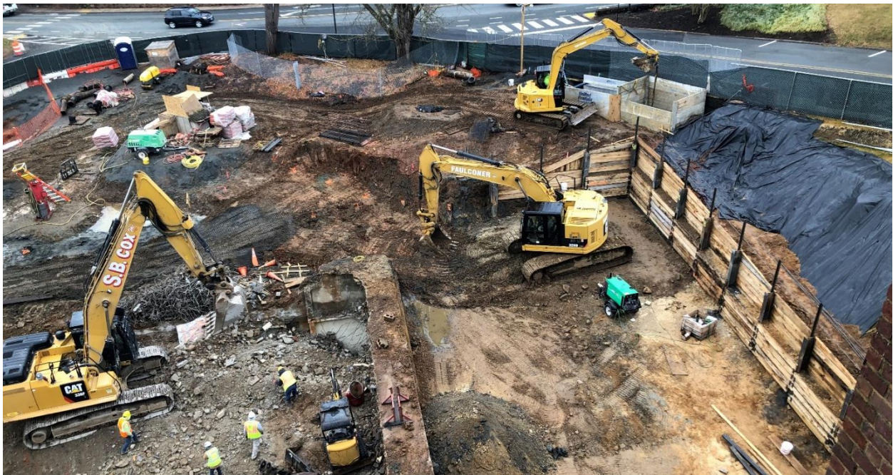
H piles and lagging, excavating for the New Stacks addition