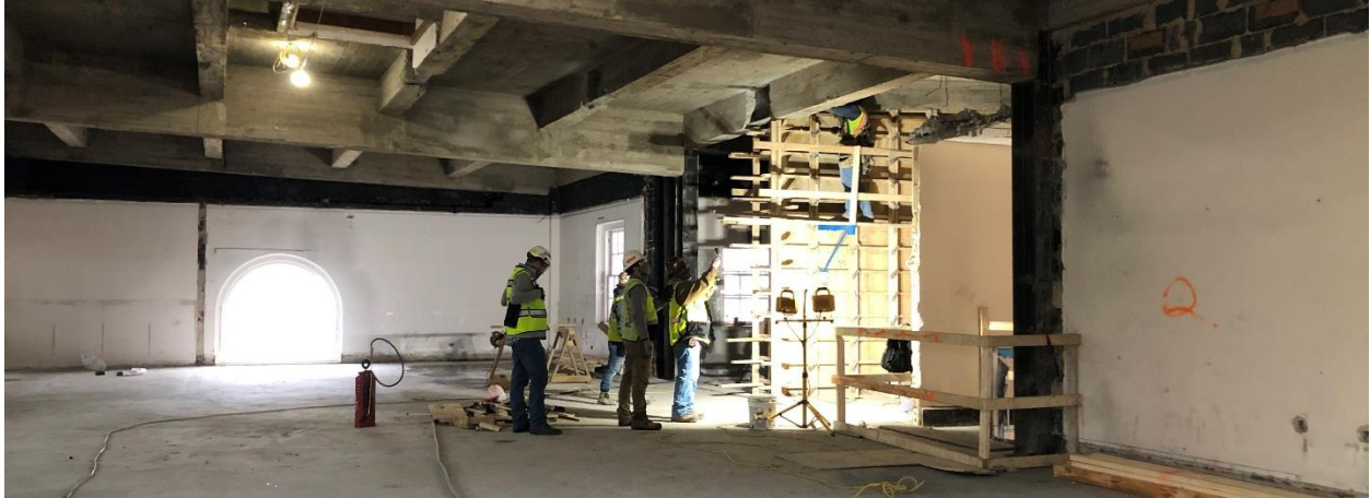
Shear Wall formwork on Level 5, former Washington Papers office beyond