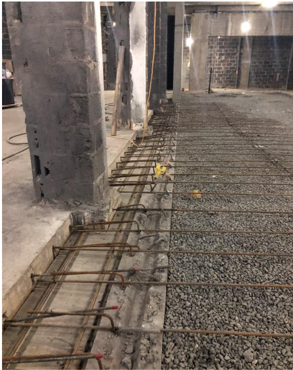
Place new concrete in Preservation Lab on level 2