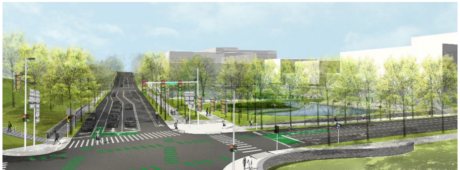
The improved intersection of Emmet St. and Ivy Rd. looking west.

This month you will see trees being removed from the International Residents College (IRC) hill due to extensive grading and rock removal that is necessary to widen the sidewalk and add a vegetative buffer between the vehicles and pedestrians. The replacement planting will be 70 native oaks and tulip polars on the IRC hill and along the street.