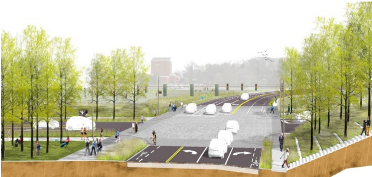
Improved conditions on Ivy Rd looking east to University Ave.