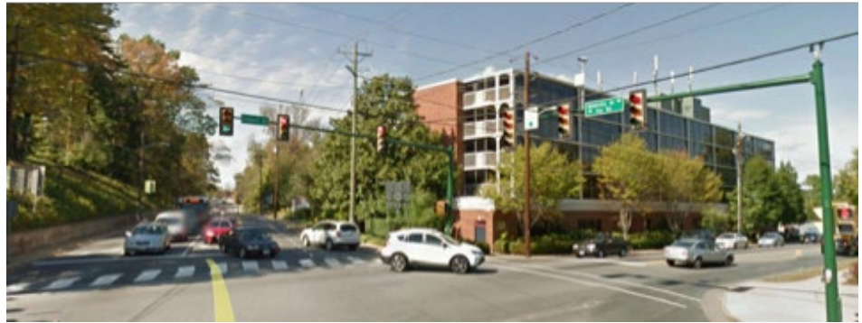
The intersection of Emmet St. and Ivy Rd. looking west 2018.

The second quarter of 2022 will be centered around prepping for multimodal and landscape improvements. These plans include widened sidewalks clear of utility poles, added native trees and vegetation, and improved road conditions.