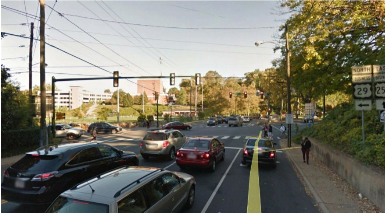
Current conditions on Ivy Rd looking east to University Ave.