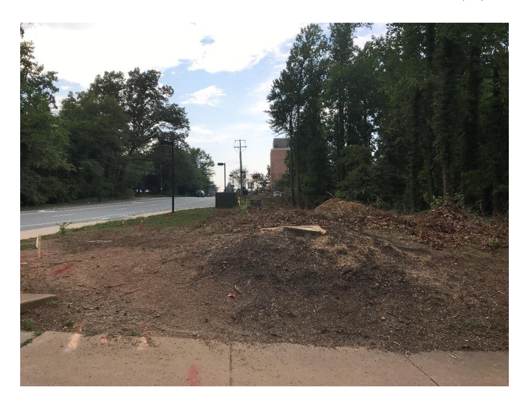
City of Charlottesville gas line relocation in Emmet Street: