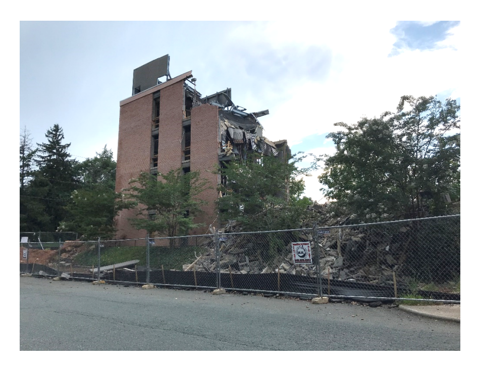
Faulconer Construction Company has mobilized on-site and has begun to receive materials: