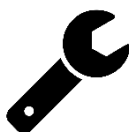
Work Order Analysis

Access is available at the Netbadge-protected website: https://tableau.admin.virginia.edu