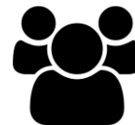
Organizations and People

Start Exploring Data ➔ Currently, there are eleven workbooks grouped into four main project/business areas. Each workbook provides insight on different aspects of FM data. Some workbooks in production include: Sources and Uses, Maintenance Work Analysis, Time Entry, and Work Order Activity. By default, data is updated daily, but some update more frequently depending on application needs.