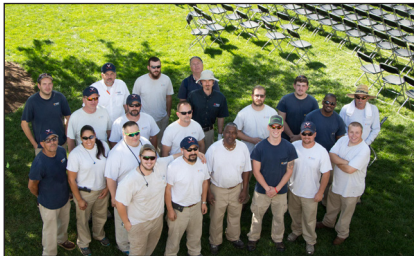
Staff, including Project Services masons/plasterers, set up 18,500 chairs on the Lawn for Finals Weekend.

The preparation for Final Exercises begins weeks before the May 20-21 event, utilizing about 200 FM employees.