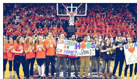
With the aid of student volunteers, UVA basketball fans diverted more than 90 percent of their game-day waste from the landfill.