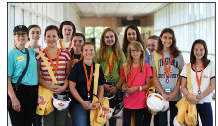
Registration is currently open for FM's second annual Girls Day, which is modeled after the national Take Your Daughter to Work Day. The event – set for June 29 – features a behind-the-scenes tour of work sites and hands-on activities at John Paul Jones Arena.

Participants may be any girl you know ages 12-18, including a daughter, niece, sister, friend's daughter, etc. Registration will take place online only this year on the following website: https://www.fm.virginia.edu/girlsday2017 . Questions? Contact the FM Girls Day Committee at fmgirlsday@virginia.edu .