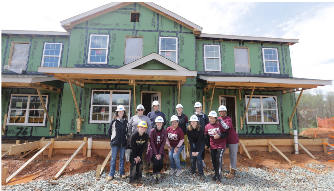
Pictured: April 4 Habitat Day volunteers.

Thank you to all of our colleagues taking part in Build Days with the Habitat of Humanity of Greater Charlottesville. Your work has a significant impact, bringing our area closer to the goal of creating safe and affordable housing for all.