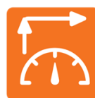
COMING SOON: INSTRUMENTATION