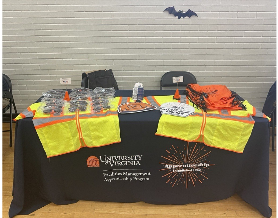
UVA FM Apprenticeship at the Pipelines & Pathways Career Fair on October 25.

Do you know of a classroom or community group that would benefit from learning more about UVA Apprenticeship? Or a local job fair that potential future apprentices may be attending?