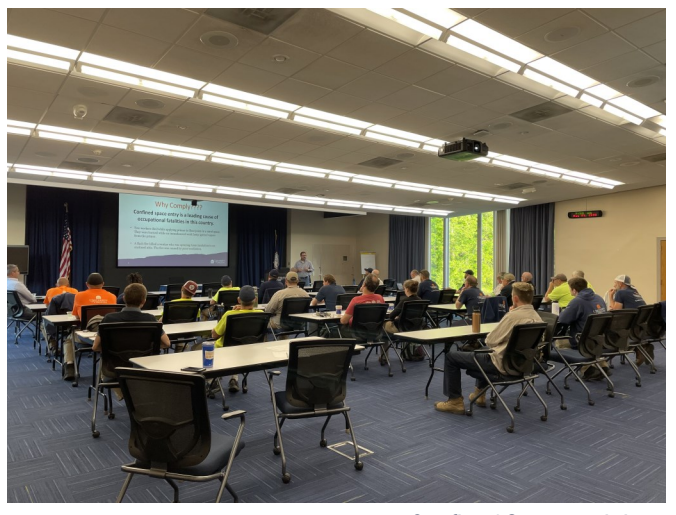
Confined Space training.

OHS would like to proudly congratulate the UVA FM Construction & Renovation Services team for completing over 400 training courses this calendar year! We appreciate every supervisor's and manager's help in getting the department caught up in their training courses, as well as staying on top of everyone's attendance.