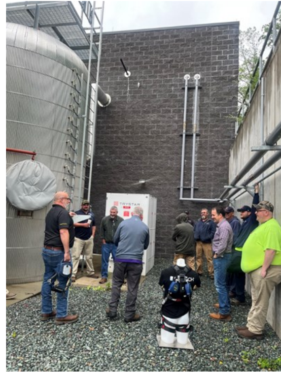
Vertical ladder safety training at the Chiller Plant on Thursday, June 22, was a success!

If you have ladders in your work area that need assessing or inspecting, please email FM-OHS@virginia.edu .